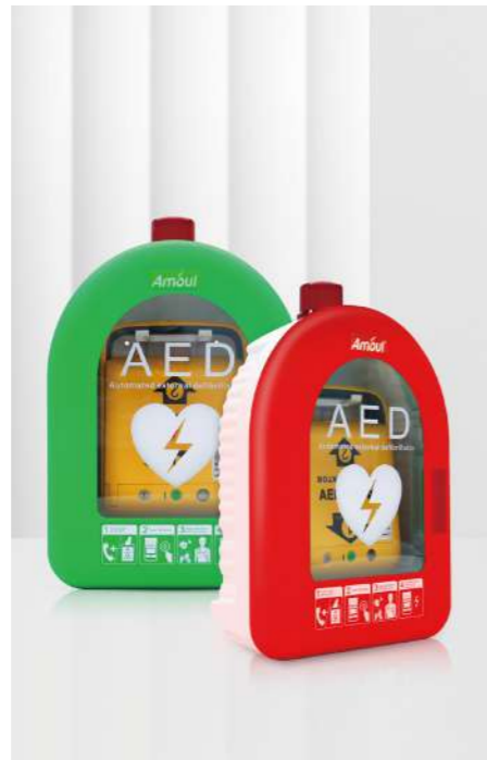
Wall Cabinet (Plastic)