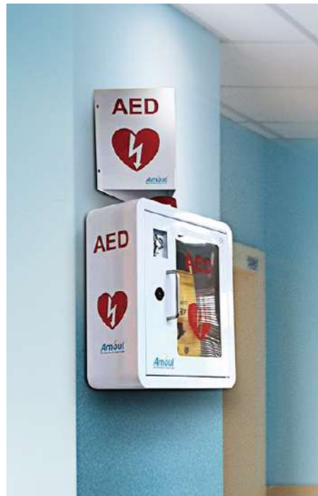
Wall Cabinet (Metal)