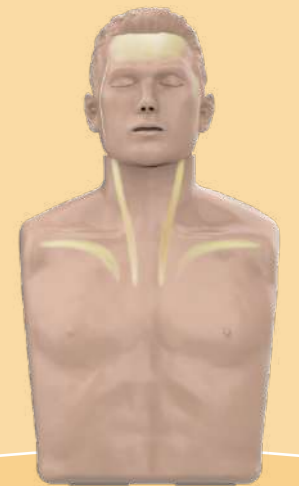
Blood Flow Visualization Manikin