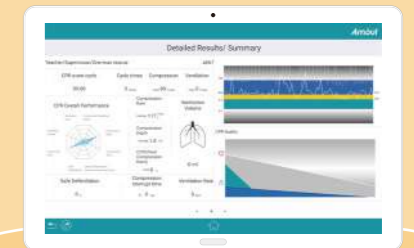
Perfect CPR Training Solution